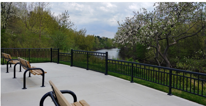
Averill Preserve's wheelchair accessible overlook of the Tittabawassee River.

It's been a busy summer out at our Averill Preserve with installing interpretative signage, a wheelchair accessible portajohn, native plantings and invasive removals. We are excited to see Averill live up to its purpose in providing access to all!