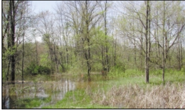
During the flood events this spring we were able to evaluate the effects of high water on our property. Bridging the L&B Drain to provide safe pedestrian access to the lower sections of the preserve will be challenging!